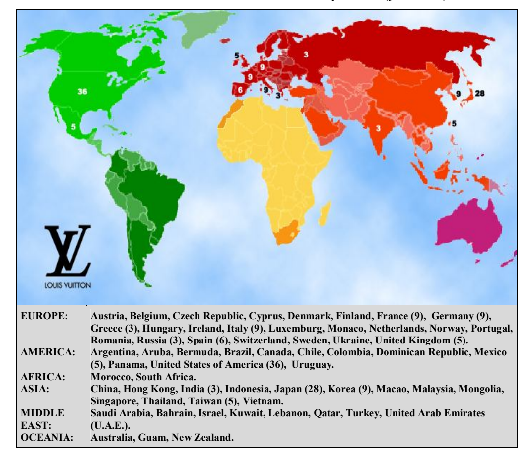
Table 4: Markets with Louis Vuitton brand presence (year 2009)

Source: Own (number of most remarkable countries point of sales).