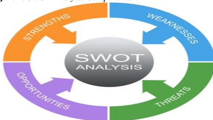
Figure 1. SWOT Analysis Components

Analysing the main components of the problem needs defining the strengths, weaknesses, opportunities and threats of the problem which leads to a SWOT analysis (Figure 1).