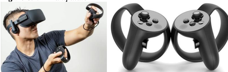
Figure 8. VR Manipulator

On the other hand, static operators will be able to control devices with the use of manipulators, Figure 3.