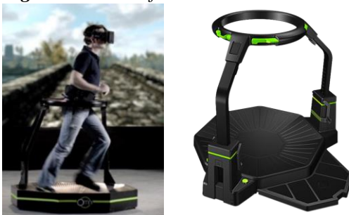
Figure 2. VR Platform

Operators would be equipped with goggles through which they could see what is happening on the reloading device. This type of solution: the VR platform with goggles is presented in Figure 7. This solution will allow you to simulate the movement of the device by moving on the platform.