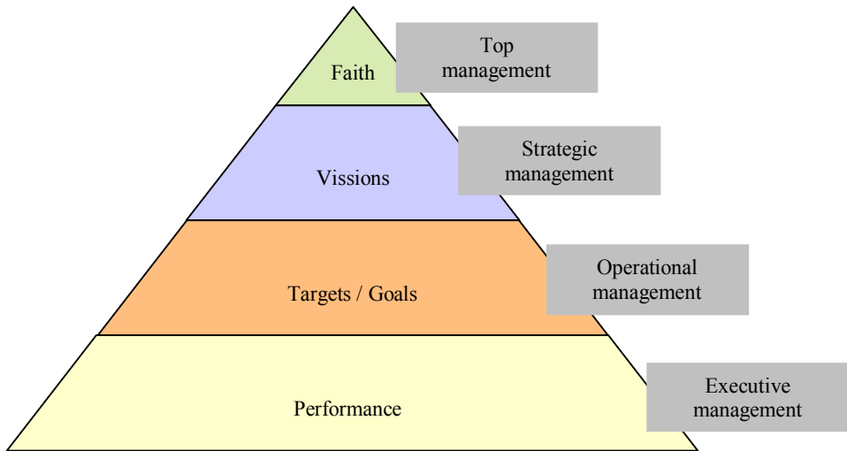
Figure 3. Vertical model for managerial jobs

There are relatively few managers at the very top of the pyramid. There are managers who unshakeably believe in their visions and for whom strategic management and work are a real mission. There are managers whose charisma and energy impress, motivate and persuade others with their unshakeable belief in their colleagues as well as investors. They are natural-born leaders and no other job would suit them. Their main motivation is not money, but the desire to be a leader, to guide people and be successful.