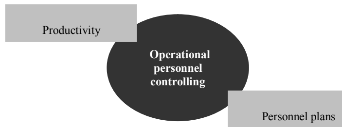
Figure 4. Operational personnel controlling

This focuses on the actual performance of the whole company with regard to the number of employees and their effectiveness as well as evaluation of the performance of individual employees, setting their plans, monitoring their performance and proposing different measures (Figure 4).