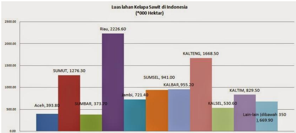
Figure 2. Production of Palm Oil by Region in Indonesia

Using rough calculations, if in 2020 the world needs from Indonesia amount to 39 million tons of CPO a total of about 39 million tonnes of FFB is needed. If one hectare of oil producing a maximum of 6 tonnes / hectare, then in 2020 at least 29 million hectares of oil palm is required. Indonesia currently has 10.2 million hectares of oil scattered in several provinces and the greatest potential is in the province of Riau (Figure 2).