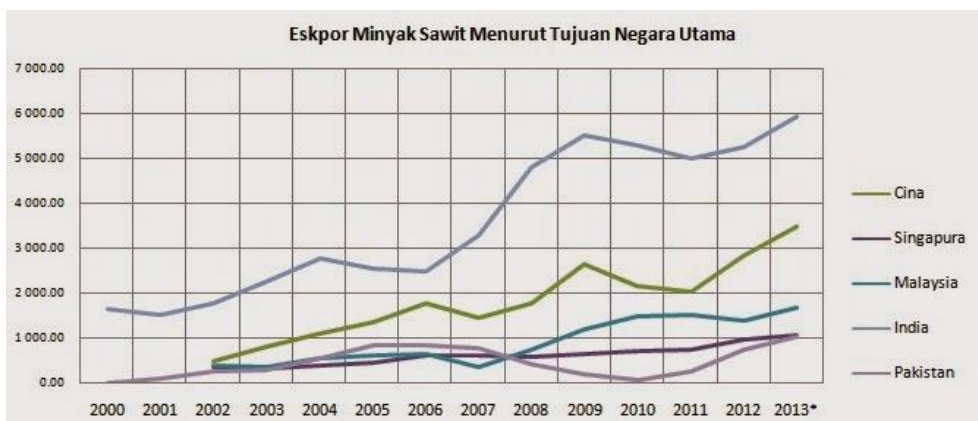
Figure 1. Oil Palm Production

Palm oil itself is a commodity product in Indonesia which during 2002-2013, overtook oil as the main stay with an average growth of 13.4% per year. The largest increase was in 2001 and 2002, which is also called the palm booming due to an increase of 42% per year. Indonesia has a big contribution in control of oil palm price in the world (Figure 1).